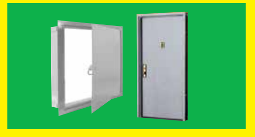
TOOLS & FOUIPMENT